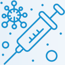
Free flu jab