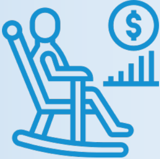
Generous pension scheme