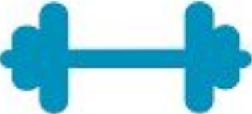
Gym discounts of up to 25% and savings on memberships