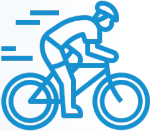
Cycle and tech salary sacrifice schemes