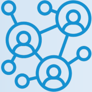
Networking & collaboration opportunities